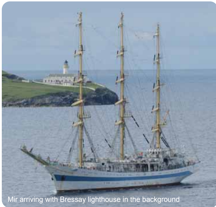
Mir arriving with Bressay lighthouse in the background

"The festival gives a big boost to the local economy, attracting over 16,000 visitors to Shetland Port. Thousands of people spectating generates a large volume of waste that needs handled and treated. Supporting this event follows on from our ongoing involvement of the Flavour of Shetland over the past four years."