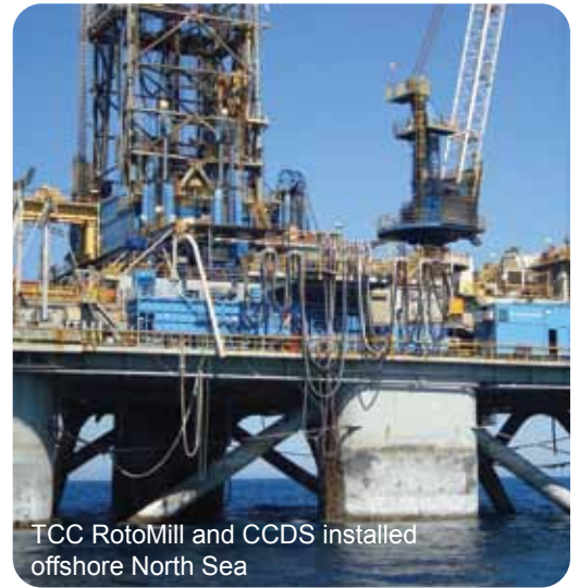
TCC RotoMill and CCDS installed offshore North Sea

"We look forward to working with TOTAL over the course of this latest drilling programme."